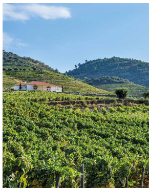
QUINTA DO BOMFIM

Pinhão, and Quinta da Senhora da Ribeira in the Douro Superior. These two vineyards consistently produce some of the finest wines when the climatic conditions are favourable. Their grapes are amongst the best that the Douro can produce. In recent years, two other properties — Quinta da Cerdeira and Quinta do Cabeço — both of which are a few kilometres from Senhora da Ribeira, have made important contributions to the blend. Cerdeira is a south-facing vineyard enjoying good exposure through the growing and ripening cycles during the summer, providing for well-ripened grapes that produce intense, well-structured wines. The Cabeço has a range of exposures to the sun giving an interesting selection of wines.