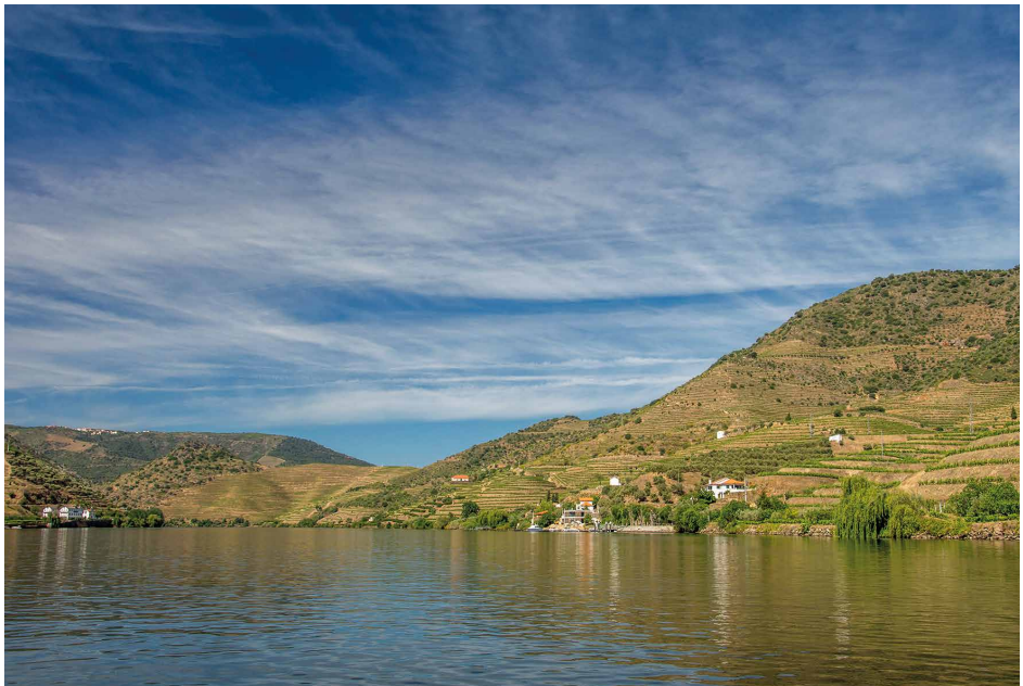
THE 'VINHA GRANDE' VINEYARDS (TOP RIGHT) AT SENHORA DA RIBEIRA

For over a century the Dow's Vintages have been blended primarily from two properties, Quinta do Bomfim, near