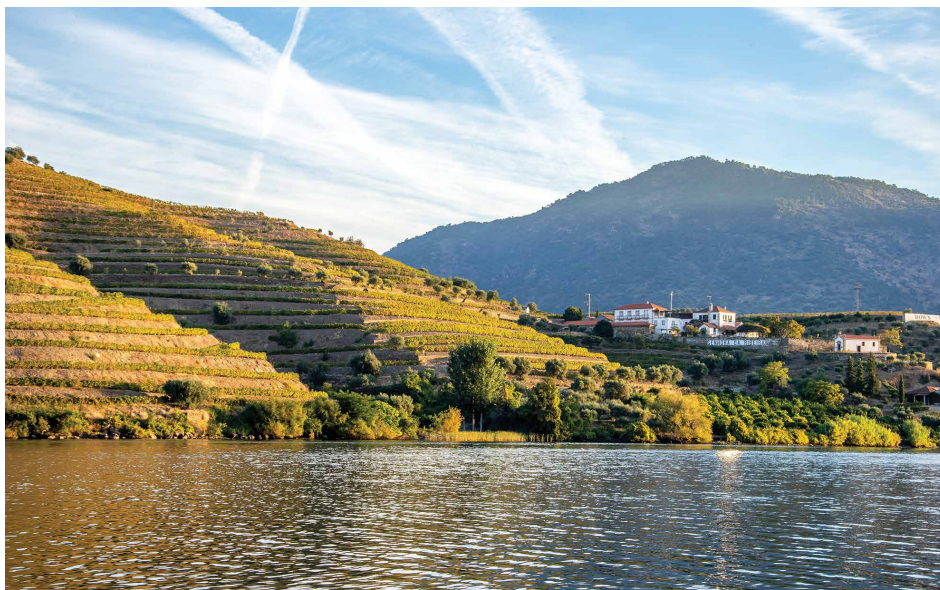
QUINTA DA SENHORA DA RIBEIRA