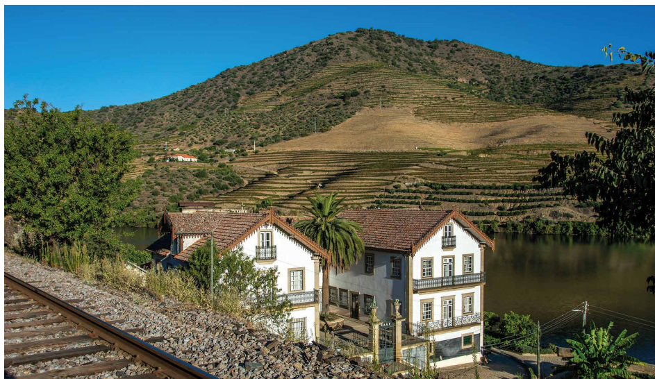
QUINTA DO VESUVIO: THE ESTATE HOUSE BETWEEN THE RIVER DOURO AND THE RAILWAY