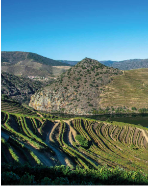
VALE DA TEJA

Yields were inevitably very low, 15% below the quinta's 10-year average, although not as low as anticipated earlier in the season. The dip in yields was more clearly visible by the fact that it took 20% more grapes to fill a lagar in comparison with other years.